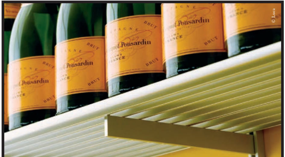
Rakks extruded aluminum shelves on “C” standards & brackets | Clicquot, Inc. New York | Design: Traboscia Roiatti Architects